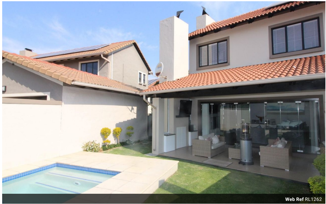
Web Ref RL1262

11 Mulberry Hill Office Park Broadacres Drive Cnr William Nicol Road Dainfern