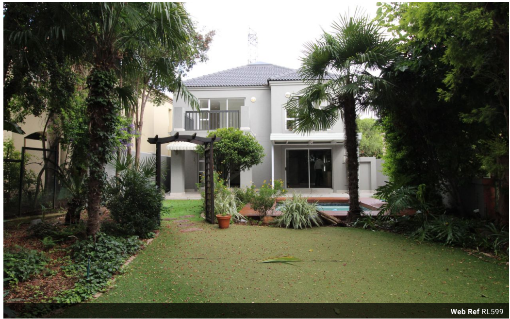
Web Ref RL599

11 Mulberry Hill Office Park Broadacres Drive Cnr William Nicol Road Dainfern