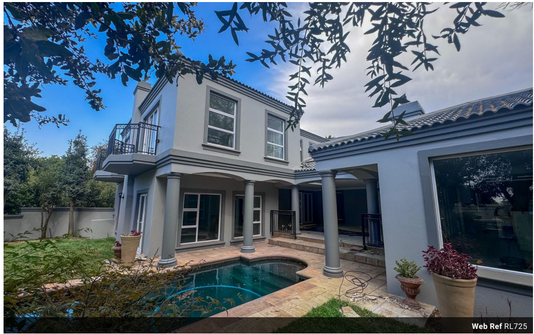
Web Ref RL725

11 Mulberry Hill Office Park Broadacres Drive Cnr William Nicol Road Dainfern