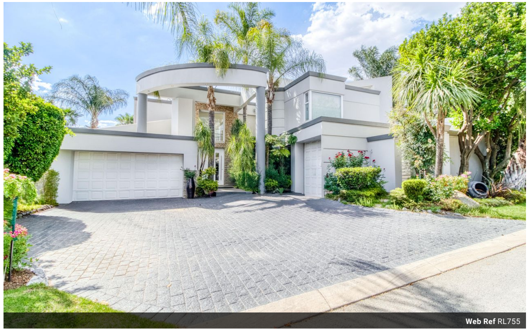
Web Ref RL755

11 Mulberry Hill Office Park Broadacres Drive Cnr William Nicol Road Dainfern