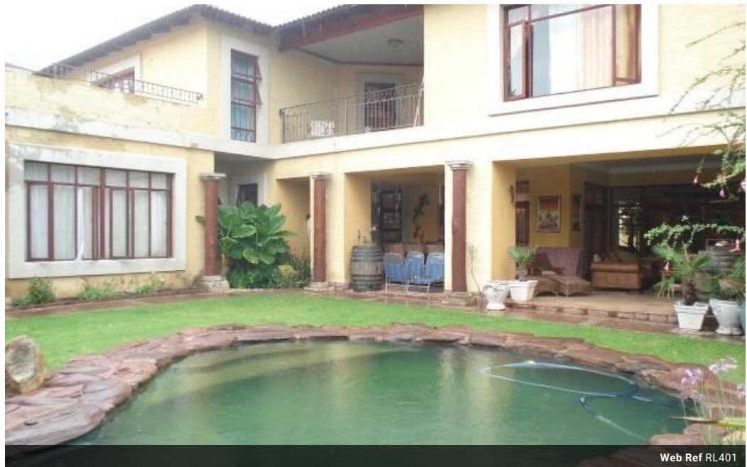
Web Ref RL401

11 Mulberry Hill Office Park Broadacres Drive Cnr William Nicol Road Dainfern