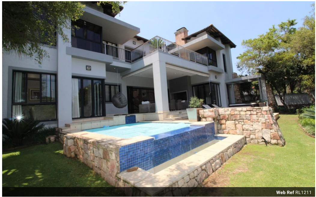
Web Ref RL1211

11 Mulberry Hill Office Park Broadacres Drive Cnr William Nicol Road Dainfern